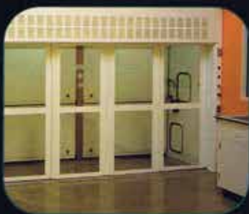
Walk-in hoods, too: Hanson fume hoods are available in any size from a 3' countertop to a 30' custom walk-in.

Tell us your needs, and we'll design a custom fume hood to meet it. Whether you need a custom size or clearance, unique access panel, additional outlets, built-in sinks, or a finish in your favorite color, just tell your Hanson Lab Planner. Chances are, we can deliver your custom hood in the time it takes our competitors to deliver a catalog model — and at the same price.